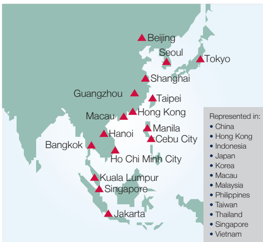
Our regional network includes 16 offices and representatives in major cities across Asia.

JLT has a reputation for hiring and retaining the best talent. We are dedicated to providing service excellence and in fostering effective partnerships within the broking, insurance and reinsurance industries, for the benefit of our clients.