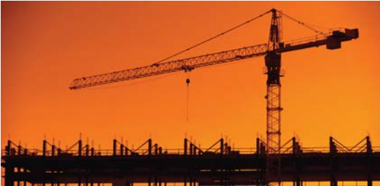
JLT acts as consultant and insurance broker to many of the world's largest construction companies and project developers.