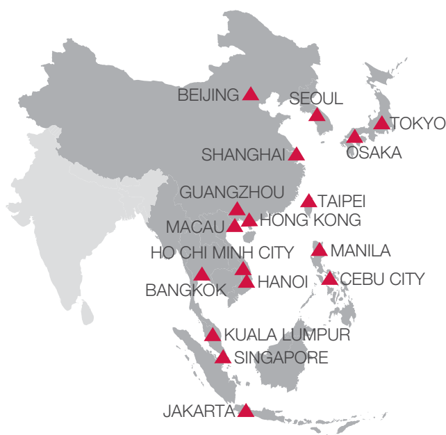
Our regional network includes 17 offices and representatives in major cities across Asia.

Employing over 280,000 people, Jardine Matheson are leaders in the fields of engineering and construction, transport services, motor trading, property, retailing, restaurants, hotels and insurance broking. Through our relationship with the Jardine Matheson Group, JLT has access to the skills and resources of one of Asia's longest established and most successful businesses.